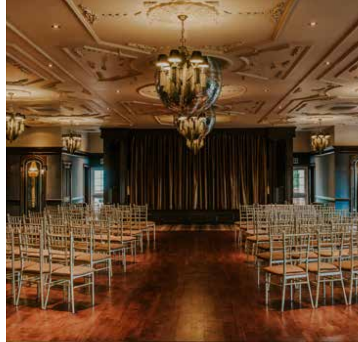
Ballroom - Conference

Biggar, South Lanarkshire, ML12 6QE | 01899 220 001 corporatesales@manorviewgroup.co.uk | cornhillcastle.co.uk