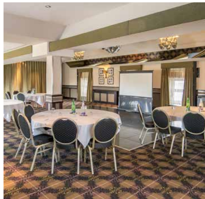
The Torrance Suite