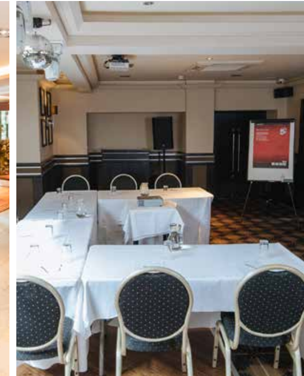
The Village Suite