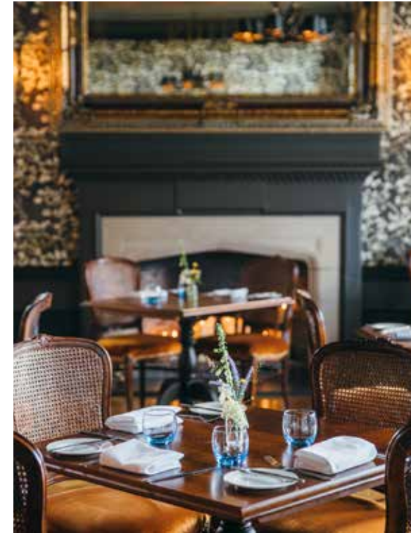
The Ghillie Restaurant