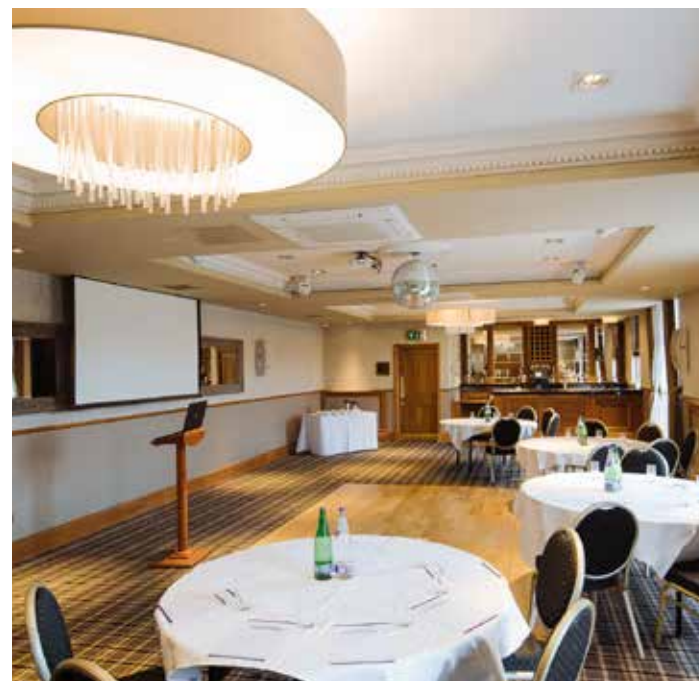
The Cartside Suite