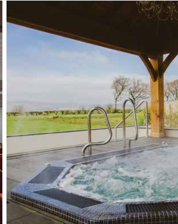
Outdoor Hydrotherapy Pool