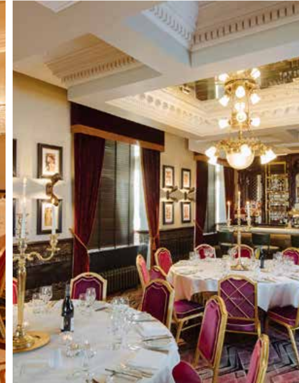
Annabel's Event Space