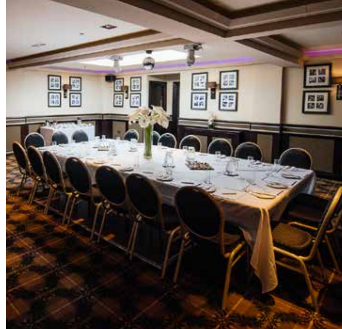
The Village Suite

CONSERVATORY: The glass Conservatory is adjacent to the Restaurant. The main feature of this space is the exceptional source of natural light and an alfresco sensation. This area can accommodate between 20 and 40 people and is the ideal setting for a private dinner, drinks meeting area or less formal gatherings.