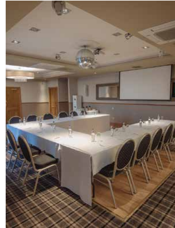
The Cartside Suite