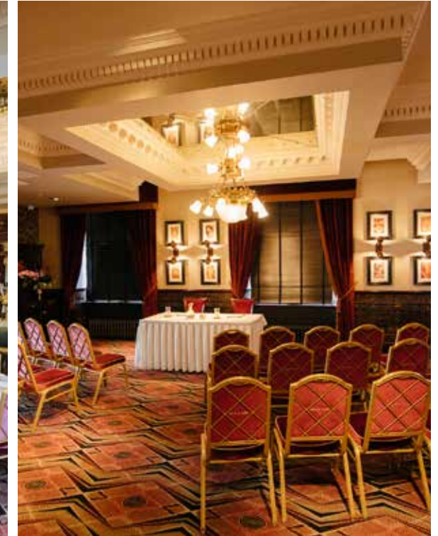
Annabel's Event Space