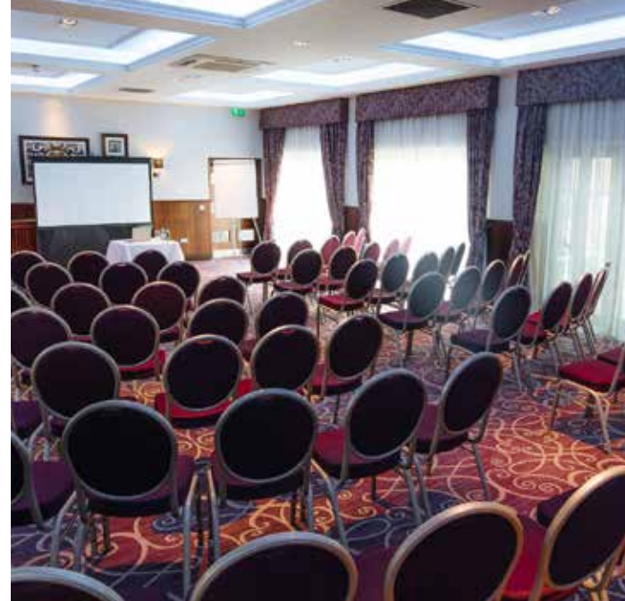
Woodland Suite - Theatre Style

Park Road, Johnstone, PA5 8LS | 01505 324331 corporatesales@manorviewgroup.co.uk | lynnhurst.co.uk