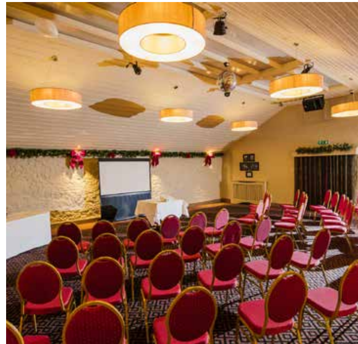
Bowfield Suite - Conference