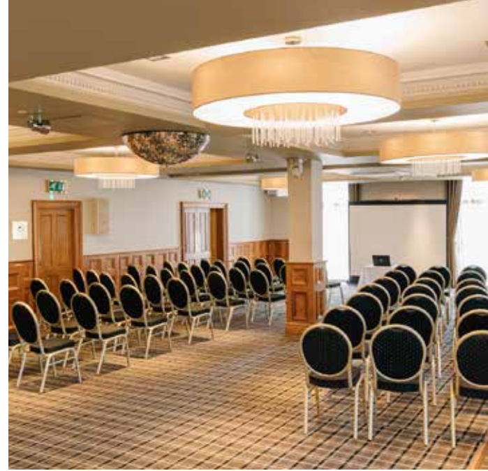
The Busby Suite - Conference

CARTSIDE SUITE: This suite cries out corporate meeting and has been specifically designed for the business client. Features include an integrated screen and projector with a BOSE surround sound. The Cartside Suite is perfect for any corporate meeting or event. It can accommodate up to 55 people both conference and cabaret style. Plenty of natural daylight pours through several patio doors which open out into a large wrap around balcony.