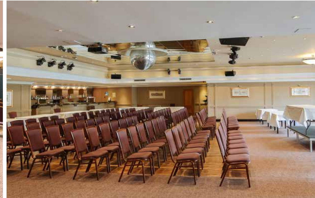
Eastwood Suite - Conference